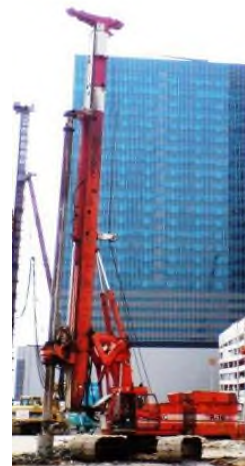
Soilmec R16 #1068