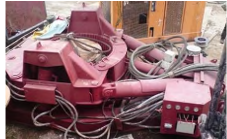
Double Wall Casing Oscillator