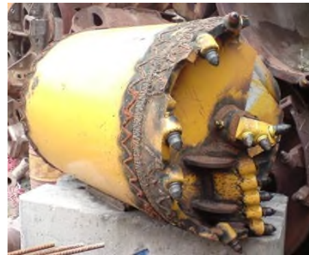
Rock Boring Bucket (for medium hard to hard rocks)