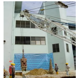
Bored Pile Hammer Grab