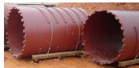
As Stollen Core Barrel (for medium hard rock & concrete)