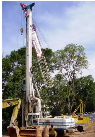
Soilmec R618 #1052