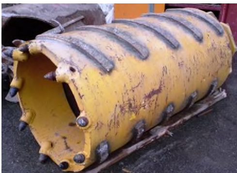
Round Shank Core Barrel (for medium hard to hard rocks)