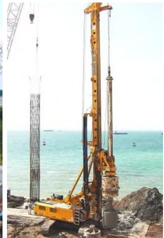
Bauer BG28 #851