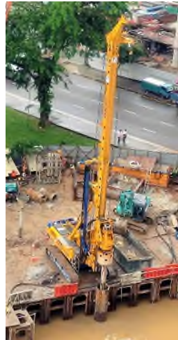
Bauer BG28 #2520