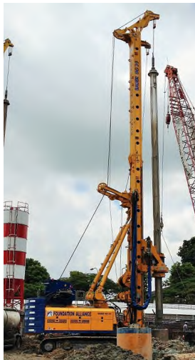
Bauer BG39 #2824