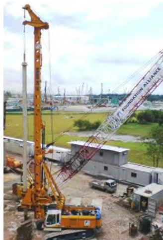
Bauer BG28 #1094