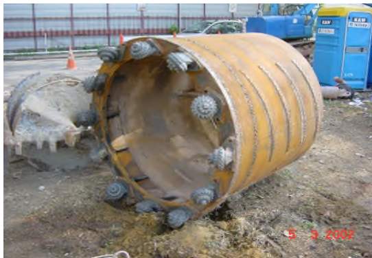
Rock Roller Bit Core Barrel (for very hard rocks)