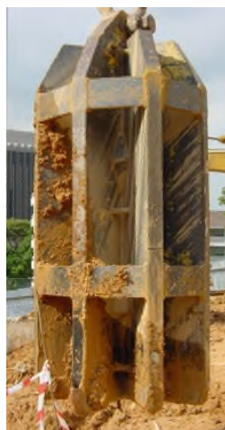
Chisel (for hard to very hard rocks)