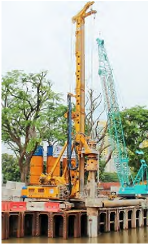
Bauer BG36 #2088