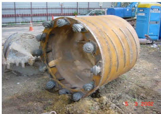
Rock Roller Bit Core Barrel (for very hard rocks)